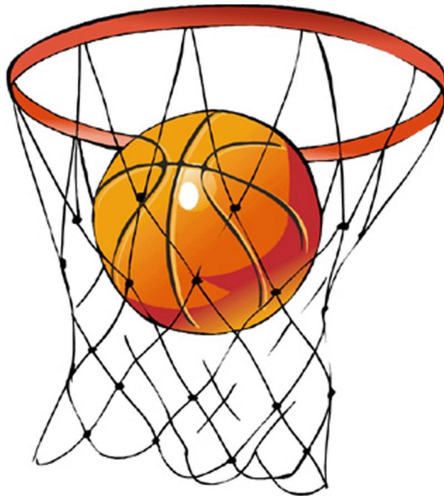
1 - Oxford Hoops Basketball Club.

Oxford Hoop Basketball Club are looking for more girls from Years 5 and 6 so that when the teams split into separate girls and boys teams, the girls will still have enough players to make up a team. If you are interested in joining the club have a look at their website:- Oxfordhoops.co.uk for more information.